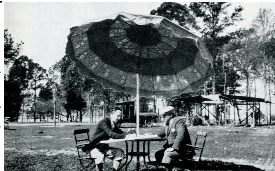
ON THE LAWN IN FRONT OF THE CLUBHOUSE

mashie iron to the green. The rough on the right is overgrown with tall pines and magnolias.