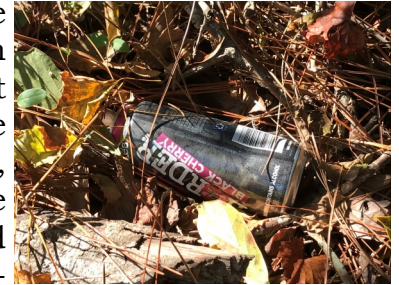
Mother Nature Does a Cover Up.

The weather was perfect the first three Saturdays in a row in November, making local events extra enjoyable. After the Peter Anderson festival on the 2 nd , the Gulf Hills Community Yard Sale followed on the 9 th with 20 participating homes scattered throughout and a good turnout by the treasure hunters. On the 16 th it was a great morning to get outside early and pickup cans, bottles, signs, white grocery bags, fast food containers, and a variety of undistinguishable, yet obviously man made and discarded items. Thanks to everyone that participated in these November community events. Here's looking for at least one more really nice Saturday before the busy Christmas season.