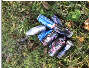
"All of these cans found in one spot on the side of Shore Drive. Do you see a common theme?"