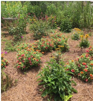
Refurbished butterfly garden

As many of you may have noticed, the Gulf Hills Garden Club has completed the restoration of the Butterfly Garden area adjacent to the Memorial Garden. This was a labor of love and was paid for mostly with a grant from the Gulf Coast Council of Garden Clubs. By traveling to a wholesale nursery to purchase the carefully chosen pollinator