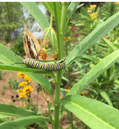
Monarch caterpillar on milkweed

nursery to purchase the carefully chosen pollinator plants, the club was able to stretch the grant dollars to maximize the variety of plants in the Butterfly Garden.