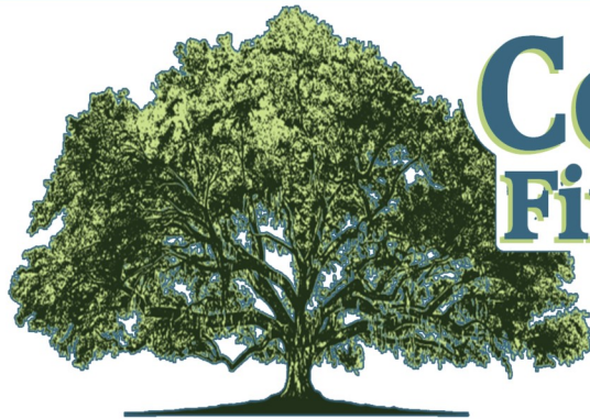
Gulf Hills Resident