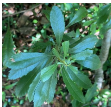
Wax myrtle leaves

I asked Gail about their decision to unlawn. She admitted they simply don't like to mow, as it is time consuming. For Charles, maintaining a traditional lawn is "the definition of Sisyphean," because the grass is fertilized and watered to make it grow, only to be hacked down. Also, the couple wished to attract wildlife and to enhance their privacy with leafy screening and buffer. Gail sees inspiration in the entirely native landscape at Shearwater Pottery: "The beauty is what's native, and you don't have to take care of it. I don't fertilize, I don't spend money on plants. Why would I want to do that when native